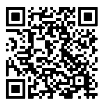
QR code can be scanned only through SKF Authenticate App.

With Registered Office at Shop No: 2-3-12 To 14/3, 57, M.G Road, Secunderabad 500003 Telangana.